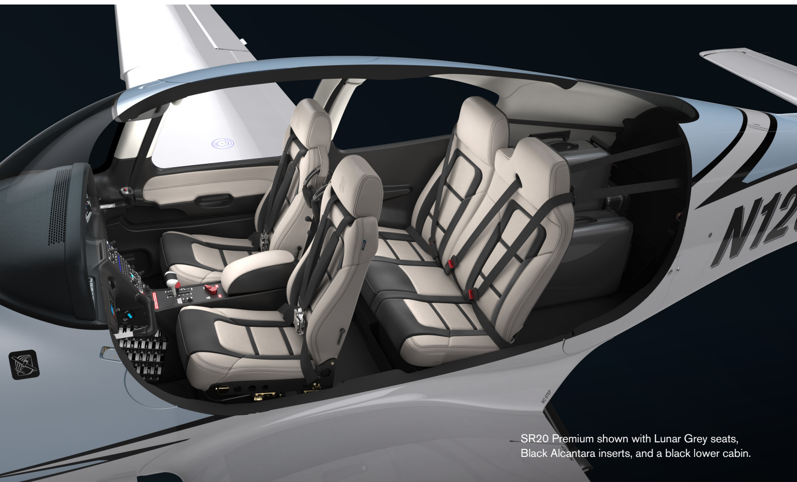
SR20 Premium shown with Lunar Grey seats, Black Alcantara inserts, and a black lower cabin.

The Premium interior is uncompromising in design, function, and comfort featuring luxurious leather, bolstered seats, and satin silver vents and lights. Expanded aesthetic flexibility provides you with the power to select from five leather colors and two cabin interiors. Add black Alcantara inserts to your seats for sporty sophistication or designate an all-leather design for timeless beauty.