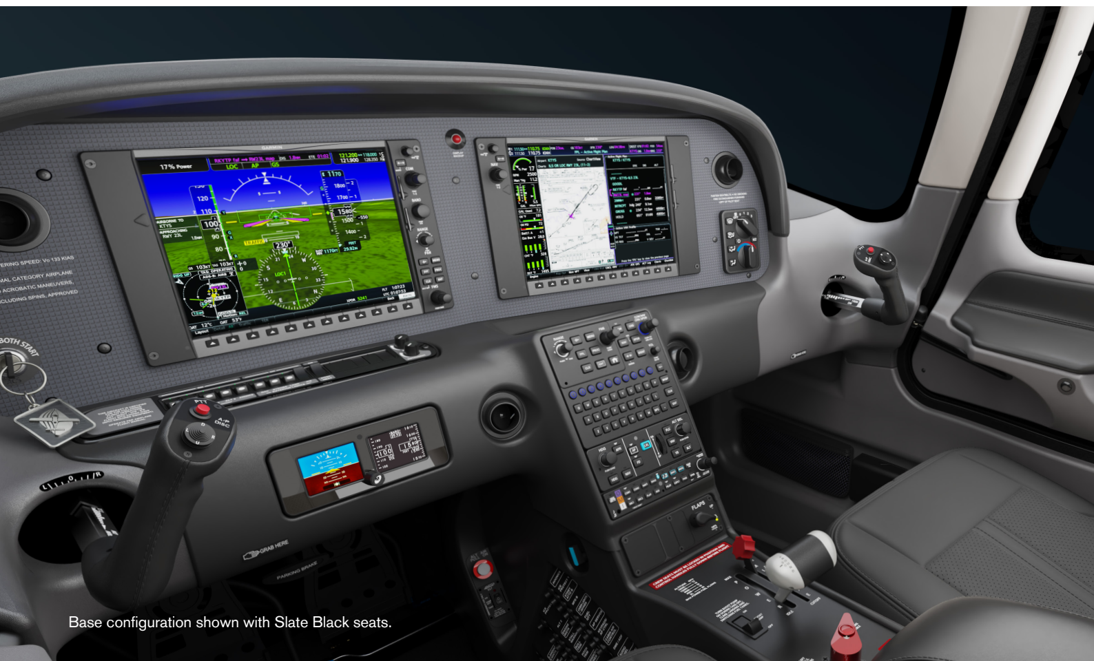
Base configuration shown with Slate Black seats.

1 Subscription Required. 2 Price does not include aircraft rental.